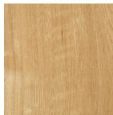
Light Oak 00240 V2 - Slight Variation