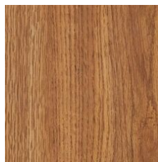
Golden Oak 00260 V2 - Slight Variation