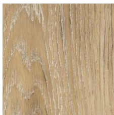
Bleached Oak 00140 V2 - Slight Variation