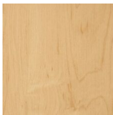
Northern Maple 00200 V2 - Slight Variation