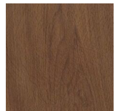
Rose Wood 00650 V2 - Slight Variation