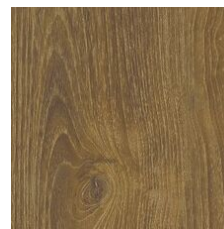
Natural Teak 00280 V2 - Slight Variation